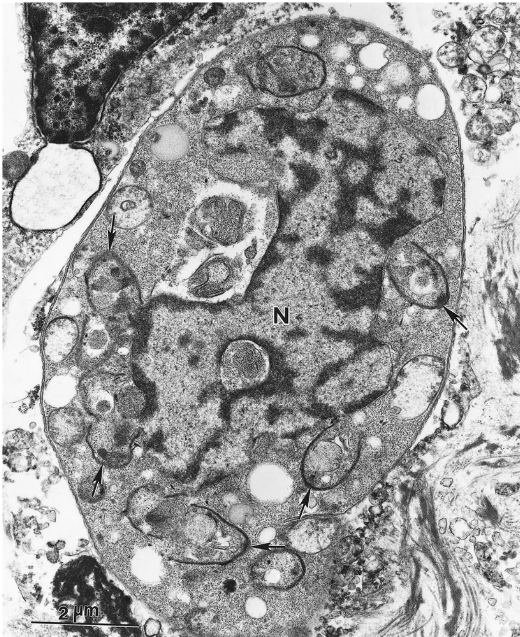
FIGURE 2. Transmission electron micrograph of an immature schizont of Sarcocystis sp. from a wild turkey with multilobed nucleus (N) and merozoite analagen (arrows).

Mississippi, Missouri, North Carolina, Puerto Rico, South Carolina, Tennessee, Virginia, and West Virginia. Funds were provided by the Federal Aid to Wildlife Restoration Act (50 Stat. 917) and through Grant Agreement 1445-GT09-96-0002,