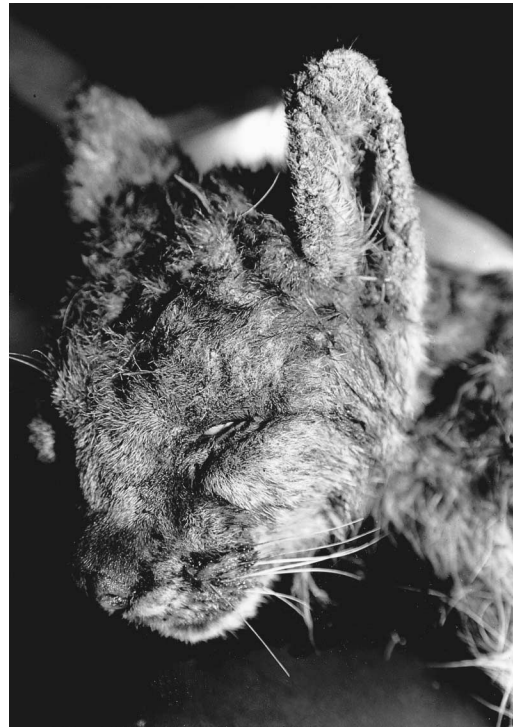
FIGURE 2. Head of Eurasian lynx affected by mange. In this case, there was a mixed infection with Notoedres cati and Sarcoptes scabiei . Notice the thick crusts covering the pinnae and the face and mild alopecia.

All carcasses were immediately brought to the Centre for Fish and Wildlife Health (Berne, Switzerland) for complete standard necropsy. Mange mites were stimulated by light and increased temperature and migrated out of skin samples onto the lid of Petri dishes (Bornstein, 1995). The mites were examined by light microscopy and identified on the basis of typical morphologic characteristics (Neveu-Lemaire, 1938; Sloss and Kemp, 1978; Kettle, 1984). Notoedres cati was isolated from the skin of lynx 1 and 2 and S. scabiei was isolated from lynx 3 and 4. Both mite species were present on lynx 5. Representa-