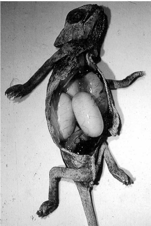
FIGURE 2. Large oviductal eggs in a dystocic female chameleon.

6.524, P = 0.029 ) which was higher in dystocic females. The activity of AST was related to an increase in CK ( r = 0.970 , P = 0.030 ) in the four individuals recorded. Mean value of uric acid was higher in dystocic females as compared to healthy females.