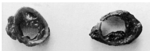
FIGURE 1. Cross sections of trachea from skua carcasses demonstrating thick, nodular, intraluminal Thelebolus microsporus mycelial mats admixed with sloughed necrotic mucosa.