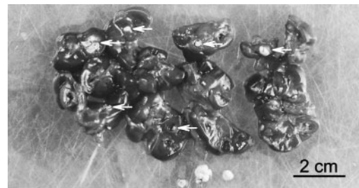
FIGURE 2. Left kidney of adult male river otter RAG-245, showing several stones (arrows) within the minor calyces.

Calculi were present in all minor calyces of the kidneys (Fig. 2). Calculi were removed, rinsed in distilled water, and air dried. A total of 4.9 g (3.2% of kidney