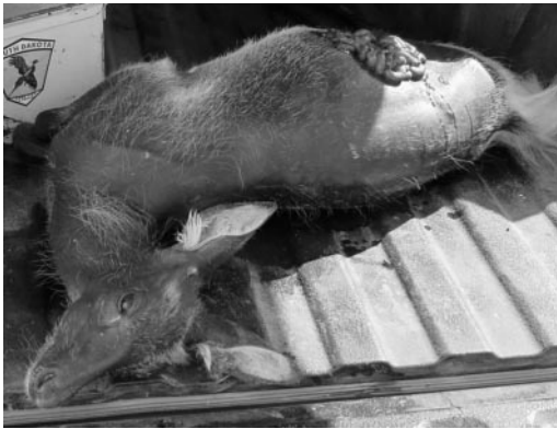
FIGURE 1. White-tailed deer fawn with congenital hypotrichosis collected from eastern South Dakota in October 2001.

ductules were empty or contained sloughed cells admixed with amphophilic to palely basophilic, globular to fibular material. In some sections, widely scattered hair follicles with normal hair-root bulbs extended into the deep dermis. These hair follicles appeared in various stages of hair development. Arrector pili muscles were usually readily evident and appeared to insert near the base of the dilated follicles. Variable sebaceous gland hypertrophy and hyperplasia was present in all sections examined.