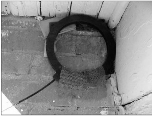
FIGURE 1. A hoop passive integrated transponder (PIT) reader in position to detect PIT tag-carrying bats. The roost exit point is largely hidden above and behind the hoop. Transiting bats possessing subcutaneous PIT tags prefer to pass through the hoop and are recorded. Hoops like this one were used to derive 14-day apparent survival estimates and 1-yr return rates.

were inserted subcutaneously over the lower lumbar region using a single-use disposable syringe presterilized by the manufacturer. The insertion point was sealed with Nexaband® tissue glue (Closure Medical Corporation, Raleigh, North Carolina, USA). The 0.06 g, 12 × 2.1 mm PIT tags emit an instantaneous (0.04 sec) 125 kHz signal with a unique nine-digit code when they pass within about 15 cm of an activating reader. The presence of individual PIT-tagged bats was passively recorded as they exited and returned from selected roost entrances through permanently positioned circular hoop activating antennas (Figure 1; NEMA readers, Avid, Inc., Norco, California, USA). A 12-V battery-powered data logger was attached to the antenna as part of the NEMA reader system. The data logger stored the digital bat individual identification code, date, and times of detection. These data were downloaded to laptop computers three times each week, and returned to the laboratory where they were entered into a standard query language database. Bats held in hand were scanned for PIT tags using a hand-held Power Tracker IV reader (Avid).