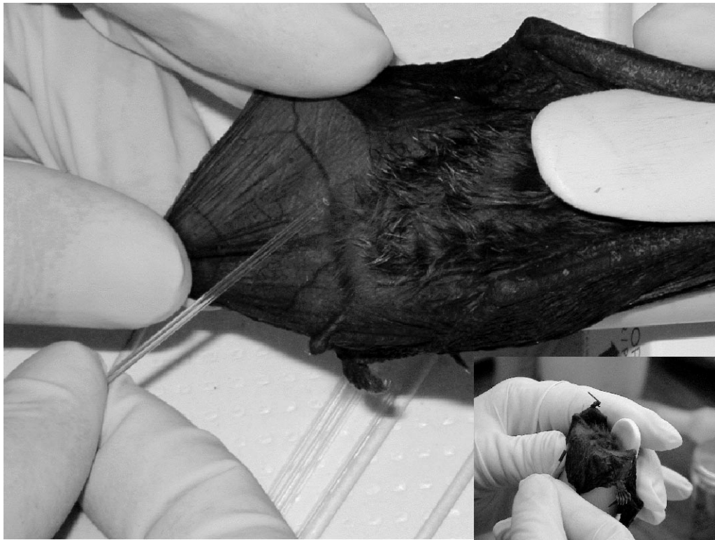
FIGURE 3. A big brown bat restrained in the anesthetic induction capsule with engorged left interfemoral vein. Blood is collected using a 75- \mu l heparinized hematocrit tube after lancing the vessel with a 27-gauge needle (inset).

manifold. Thus, six separate patient circuits, each with their own endotracheal fitting and anesthetic induction capsule, allowed anesthetic induction and maintenance of up to six bats simultaneously. Initial induction consisted of 4–5% isoflurane and 1 l/min oxygen delivered per bat. Anesthesia was maintained at 2–3.5% isoflurane, using the same oxygen flow rate. Each capsule was disinfected with alcohol between uses. Collection of blood was made by initially warming the site with a hot water bottle until interfemoral vein engorgement was evident in the tail membrane (Fig. 1). A 27-gauge needle was used to lance the interfemoral vessel, typically from the dorsal aspect. Blood was collected into multiple heparinized hematocrit tubes (75 \mu l; Fisher Scientific, Pittsburgh, Pennsylvania, USA). The goal was to collect under 1% of body weight in blood volume equivalent from each bat. In some cases, bilateral vessels were accessed to guarantee an adequate sample. Hemostasis was accomplished by applying direct pressure with cold packs, or rarely by application of hemostatic gel (Cauter-Gel, Mensa Products, Fort Lauderdale, Florida, USA). Bats were observed until recovery, then