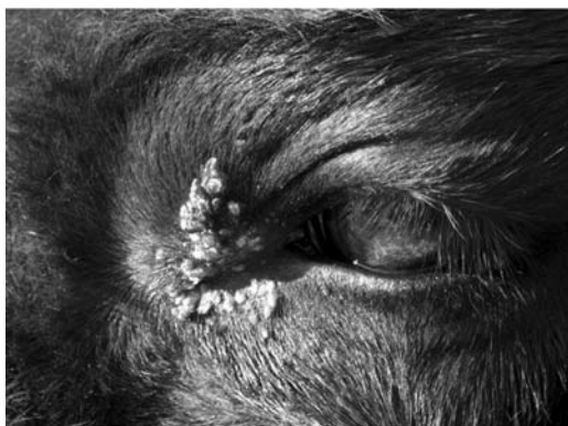
FIGURE 1. Papillomas at the medial canthus of the left eye of a European bison.

were found on this or any other bison, or even any other animal in the zoo. The bison enclosure of the Bussolegno Zoo adjoins the domestic cattle enclosure, but no papillomatous lesions were found there either. Nor did physical examination of the bison on their arrival at the Bukovské Vrchy Hills reveal any skin lesions. The keeper taking care of the bison during their stay at the acclimatization game preserve first noticed the papillomas at the eye of the one bison when it had been in the preserve for some (unspecified) time.