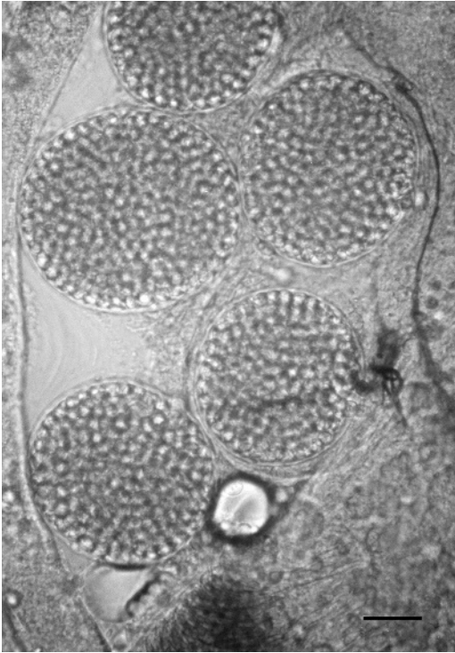
FIGURE 2. Squash preparation of Megabothris abantis infected with Hepatozoon sp. (Wright-Giemsa stain). Sporocysts in oocysts, magnification 320 \times , scale bar=25 \mu m.

in three of the four characters (maximum oocyst diameter, number of sporocysts per oocyst, maximum sporocyst diameter, and number of sporozoites per sporocyst) we have evaluated.