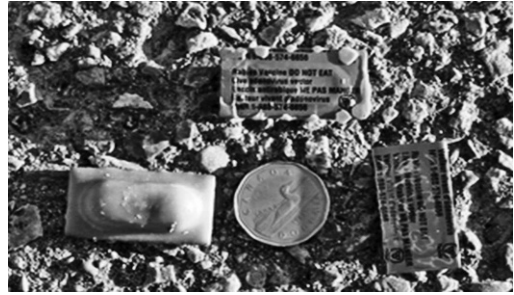
FIGURE 1. Photo of ONRAB® rabies vaccine-baits.

Here, we report on field trials designed to determine the efficacy of AdRG1.3, hereafter called ONRAB®, in baits, for immunizing free-ranging skunks and raccoons against rabies in SW Ontario. The