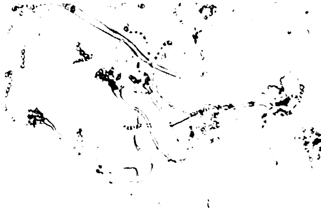
FIGURE 3. Fungal elements from a Sabouraud agar plate inoculated with material from lesions shown in Figures 1 and 2. Cotton blue-stained wet mount.