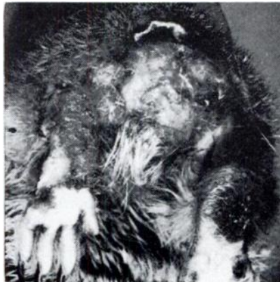
FIGURE 2. Tail region of squirrel showing serous exudate present after removal of scabs.