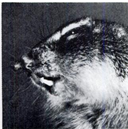
FIGURE 1. Thick crusted material on nose of squirrel.

In July, 1967, one of the squirrels was presented at the Ontario Veterinary College because of skin lesions which had been noted approximately two weeks earlier. The animal was euthanized and examined. Thick crusts of material which appeared to be keratinized skin were found on the nose and cheeks (Fig. 1). The scabs were tightly adherent and the underlying tissue was moist and hyperemic. There was erythema and alopecia of the hind legs and perineal region; the tail was a naked stump approximately 2 cm long (Fig. 2). Smears made from the serous exudate beneath the scabs were stained with Giemsa. Numerous long filaments which appeared to be dividing transversely and longitudinally to form coccoid bodies were observed (Fig. 3). This type of growth is considered to be diagnostic for Dermatophilus (Roberts, 1967, Vet. Bull. 37 (8): 513). In stained tissue sections the organisms appeared to be restricted to the epidermis, in which there were areas of hyperkeratosis and micro-