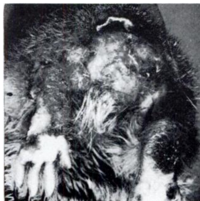
FIGURE 2. Tail region of squirrel showing serous exudate present after removal of scabs.