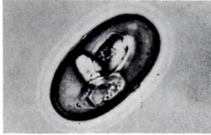
FIGURE 2. A typical sporulated oocyst of E. dorneyi .

E. glaucomydis (Roudabush, J. Parasitol. 23: 107-108, 1937), known from the Southern flying squirrel, G. volans . A photomicrograph of a typical oocyst of E. dorneyi is shown in Figure 2.