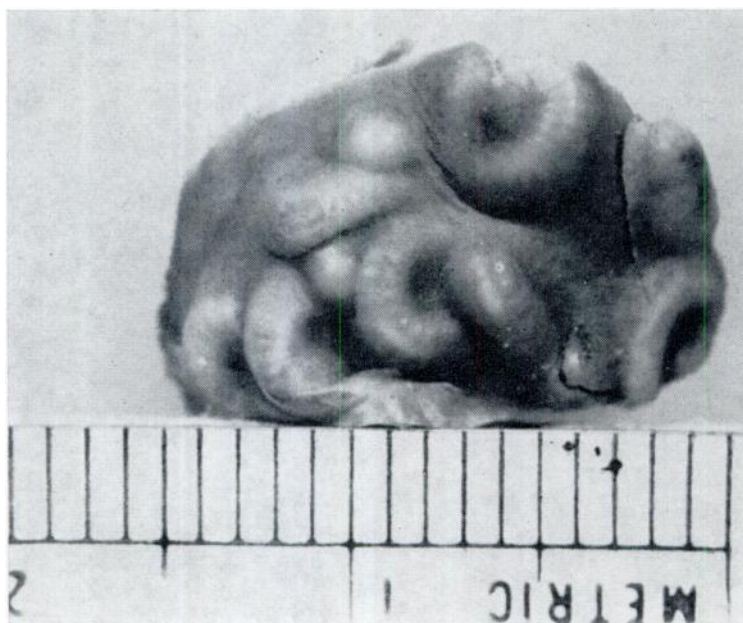
FIGURE 1. Portion of ferret-badger liver with encysted larvae of Armillifer sp.