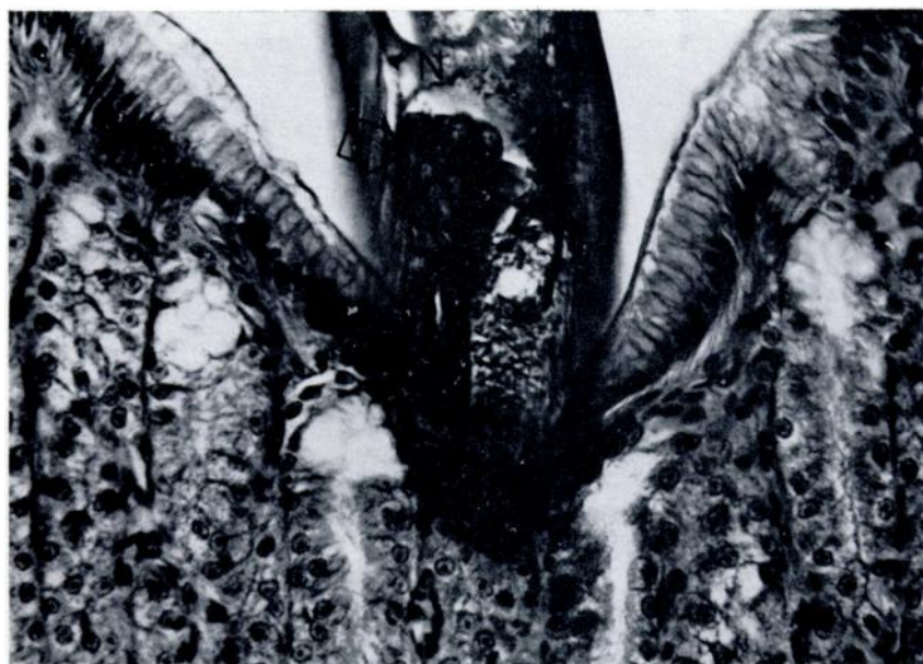
FIGURE 2. Third-stage Physaloptera larva at edge of tubular mucosal lesion. Note oral glands (arrow) anterior to the nerve ring (N). x 425.