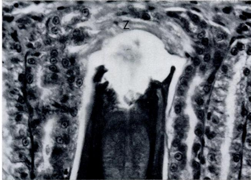
FIGURE 3. Third-stage Physaloptera larva at base of tubular lesion. Zone of liquefaction at point of attachment (Z). x 600.