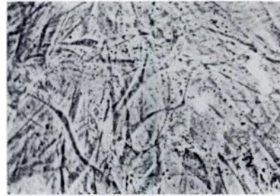
FIGURE 2. Cells from mesentery of dolphin — 1 month in culture.