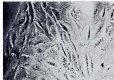
FIGURE 4. Cells from kidney of gray seal — epithelial-like and possibly transformed.