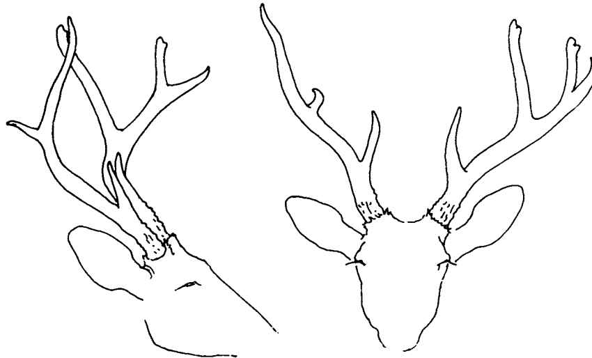
FIGURE 2. Typical antler deformity of deer with left rear leg amputated.

in the pattern of antler development. The second year, the three amputees (left rear legs) produced deformed antlers contralateral to the amputated leg. The two deer that had undergone neurectomy earlier developed antlers which were much more severely deformed than those of the other experimental deer (Fig. 3).