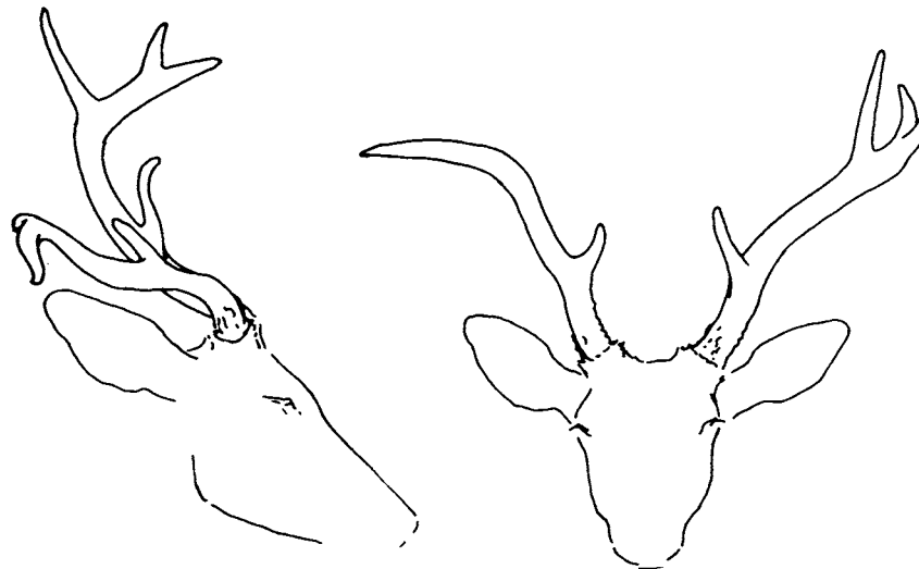
FIGURE 3. Antler deformity of deer with left leg amputated following neurectomy the previous year.