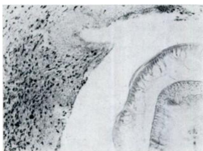
FIGURE 2. Section of stomach showing submucosal cyst containing parasite. Haematoxylin and Eosin. X 240.