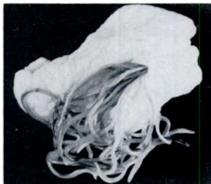
FIGURE 1. Portion of gastric lesion showing attached worms.