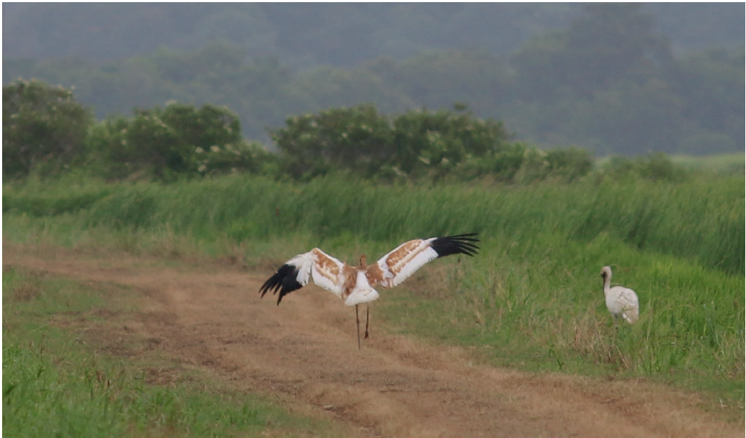
FIGURE 1. Whooping Crane ( Grus americana ) juvenile LW1-16 (center) from the Louisiana, USA nonmigratory population at approximately 14 wk old in 2016. Note the disparity between the fully extended right wing and the partially extended left wing, which is held at an abnormal angle from the carpal joint. Also note the shorter length of the seventh and eighth primary remiges of the left wing, which were delayed in growth but eventually reached full size.

noted contraction of the propatagium and tightness of the tendon which was displaced ventrally, creating a fold on the underside of the leading edge of the wing next to the carpal joint. We attached leg bands and a very high frequency transmitter for identification and tracking purposes, then collected blood and other biologic samples. Once we released the chick, the parents aggressively prevented it from rejoining them, thus finalizing their separation. The chick stayed near (<2.5 km) its parents, who began nesting within days of the chick's capture. However, it is common for immature Whooping Cranes to remain in the vicinity of their natal area (Urbanek and Lewis 2015), so it is conceivable that the wing abnormality did not play a significant role in the distance it maintained from its parents following independence. This same pair of adults raised two healthy chicks in 2018, and GPS data indicated comparable average distances traveled by the families from the nest during the postfledging periods in 2016 (1.0 km) and 2018 (1.4 km), further suggesting