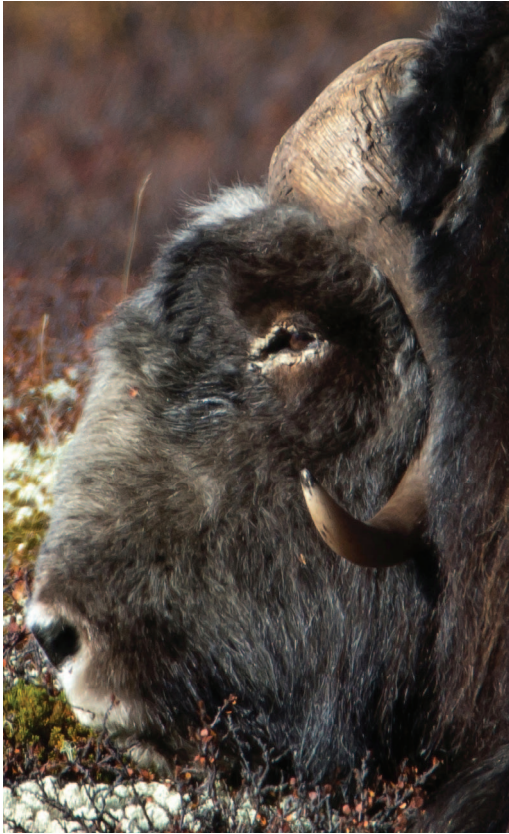
FIGURE 1. Muskox ( Ovibos moschatus ) from Dovrefjell, Norway with crusts (pus) around the eye, 10 September 2014.

On 17 September, an old bull displaying locomotory problems was reported to the Norwegian Nature Inspectorate. At inspection, the bull showed signs of posterior paresis, held its right eye closed, and was euthanized on animal welfare grounds. At postmortem, the right eye was surrounded with a ring of semisolid pus and showed signs of acute keratoconjunctivitis, with hyperemic conjunctiva and an opaque cornea, covered by a mucopurulent exudate. The left eye seemed clinically unaffected. Swab samples were taken from the conjunctival sac of each eye and preserved in an in-house virus transport medium containing penicillin, streptomycin, and amphotericin B.