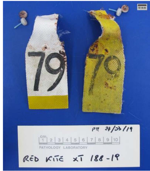
FIGURE 2. Patagial wing tags removed from left wing (white) and right wing (yellow) of a Red Kite ( Milvus milvus ) designated Red Kite 1, found in Deene, Northamptonshire, UK, September 2018.

Red Kite 1, which had been tagged as a fledgling in 2004, was found dead on a footpath on 31 August 2018 in Deene, Northamptonshire, received at IoZ on 11 September 2018, and immediately frozen at -20^{\circ}\text{C} until examination on 13 September 2018. This adult female was carrying a patagial tag on each wing (Fig. 2). The carcass weighed 918.6 g (adult female range 800–1,300 g; Snow et al. 1998) and was deemed