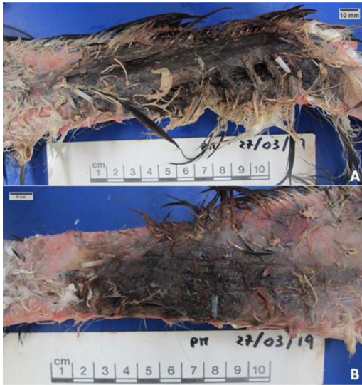
FIGURE 3. Red Kite 1 ( Milvus milvus ) found in Deene, Northamptonshire, UK, September 2018. (A) Dorsal view of the right wing showing poorly demarcated and friable skin lesions under the patagial wing tag, extending from the distal third of the radius-ulna to the carpal joint on the dorsal aspect of the right wing. The tag was removed from the wing and the feathers plucked. (B) Dorsal view of left wing showing a skin lesion under the patagial wing tag on the dorsal aspect of the left wing. The tag was removed from the wing and the feathers plucked.

degree of autolysis and many degenerated parasites (interpreted as the fly larvae seen on gross pathology). Areas of skin with only moderate autolysis showed a nonspecific mild mononuclear inflammatory infiltrate.