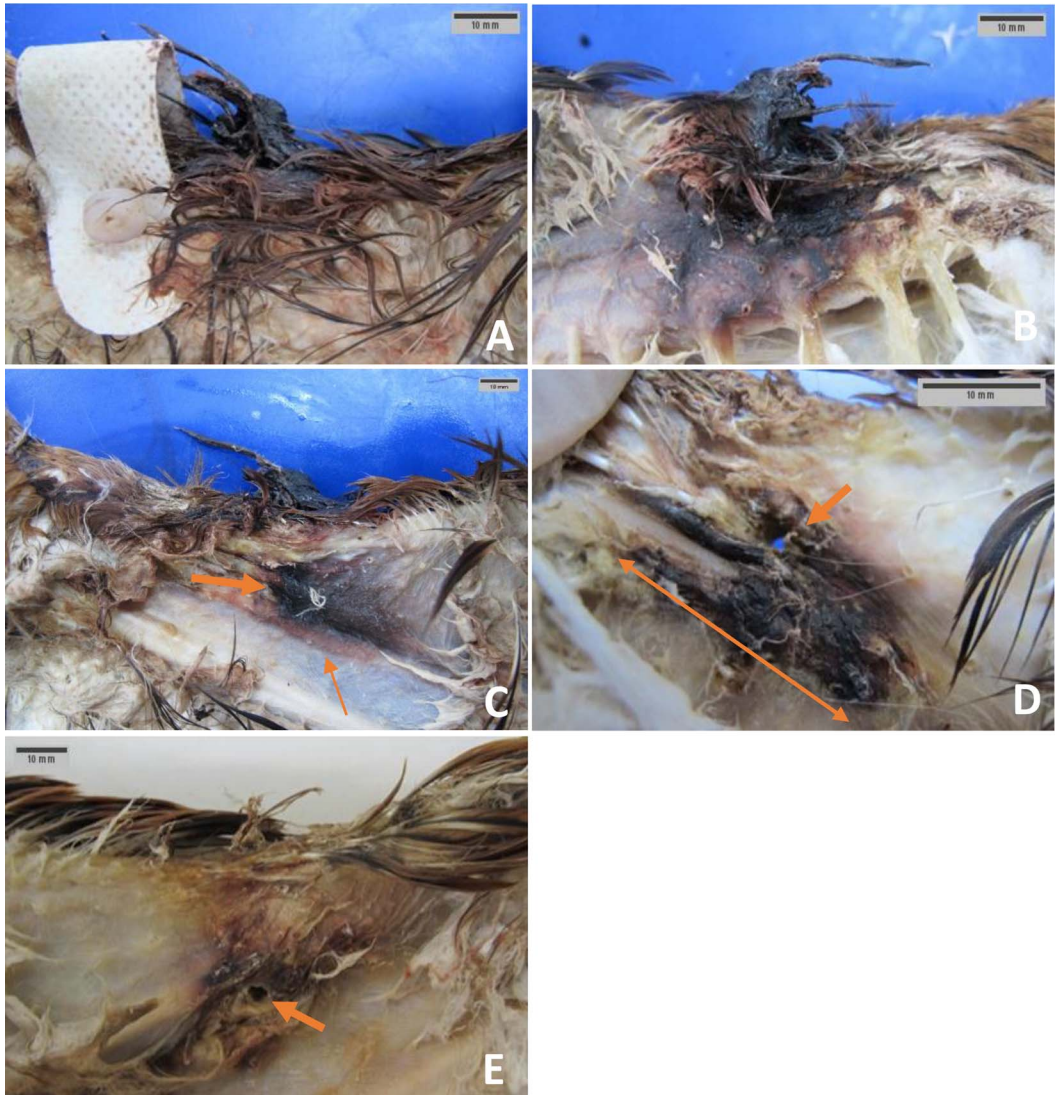
FIGURE 4. Red kite 2 ( Milvus milvus ) found at Harewood, near Leeds, Yorkshire, UK, February 2003. (A) Ventral view of the leading edge of the right patagium on the right wing. On the left, the white textile of the tag secured on the wing by the plastic rivet; centrally, an accumulation of dried blood overlying the apparent recent skin laceration. (B) Site of the laceration on the leading edge of the patagium on the dorsal aspect of the right wing after removal of the patagial wing tag and plucking of the feathers. Centrally, an accumulation of dried blood. (C) Focal dark-black skin lesion, suspected subcutaneous hemorrhage (thick arrow) and reddening skin (thin arrow) on the ventral aspect of the patagium of the right wing. The wing tag was displaced laterally on the left of the picture and the feathers plucked. (D) Locally extensive firm black skin lesion (double arrow) below the piercing hole (single arrow) of the patagial wing tag, dorsally on the left wing. The tag was removed and the feathers plucked. (E) Locally extensive skin lesion around the piercing hole (arrow) of the patagial wing tag, ventrally on the left wing. The tag was removed and the feathers plucked.

apparently chronic lesion associated with the patagial tag, but it was not known if the pre-existing lesion increased the susceptibility of the Red Kite to develop the laceration.