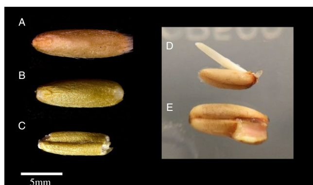
Figure 2. Caryopsis at different levels of seed coat and embryo damage can be observed: (A) intact caryopsis; (B) caryopsis with ideal damage to the seed coat located on the distal part to the embryo where the endosperm is slightly exposed, allowing for water movement to the embryo to trigger germination; (C) the embryo has been destroyed; (D) successful germination after the application of treatment T6 (1,500 rpm for 5 s); (E) imbibed caryopsis which failed to germinate after the application of treatment T8 (1,500 rpm for 10 s).

removal, sandpaper scarification, immersion of the seed in sodium nitroprusside (NO donor SNP) solution, and untreated control (Table 3). These seed germination techniques were applied to population 'e' (Table 1) using the methodology outlined in Table 3. There were three replicates for each treatment (50 seeds each). The experiment was conducted in parallel to Experiment 3 in February 2020 and repeated in August 2020. To validate the germination results, all ungerminated seeds were treated with 2,3,5-triphenyl tetrazolium chloride to assess viability as previously described.