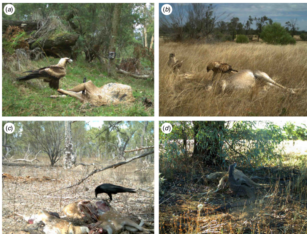
Fig. 3. Examples of Australian wildlife scavenging on the carcasses of animals shot with lead-based bullets. (a) A wedge-tailed eagle ( Aquila audax ) feeds on the carcass of a shot sambar deer ( Rusa unicolor), (b) black kites ( Milvus migrans ) feed on the carcass of a shot western grey kangaroo ( Macropus fuliginosus), (c) an Australian raven ( Corvus coronoides ) feeds on the carcass of a shot chital deer ( Axis axis) and (d) a lace monitor ( Varanus varius ) feeds on the carcass of a shot western grey kangaroo. The images were captured in the same way as described by Legagneux et al. (2014), namely by placing camera traps on the carcasses of shot animals (Forsyth et al. 2014).