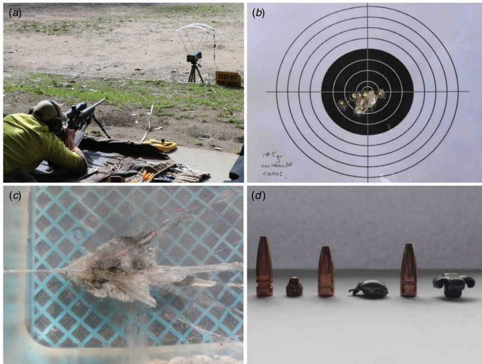
Fig. 1. Shooting range methods used for testing new ballistic technology before beginning animal-based trials, eastern Australia, 2018. (a) Use of a chronograph to measure projectile velocity, (b) assessment of precision through shot grouping, (c) use of tissue simulant gel to assess terminal ballistics patterns, and (d) examination of bullet weight retention and deformation.