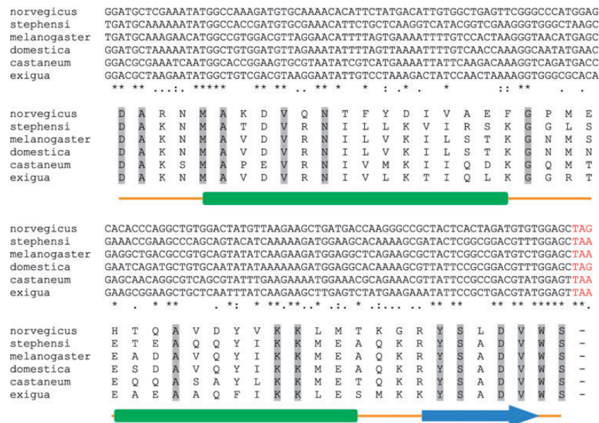
Fig. 4. Nucleotide and amino acid sequence comparisons of the last exons of the CPR coding regions between A. stephensi and other organisms. The one-letter code for each amino acid is aligned with the second nucleotide of each codon. The predicted secondary structures of the A. stephensi CPR are shown under the amino acid sequences. The green bar represents the alpha helix, and the blue arrow represents the beta sheet. Identical residues in amino acid sequences are highlighted. Organisms included in the analysis are R. norvegicus (representing a vertebrate); Drosophila melanogaster and Musca domestica (representing Diptera along with A. stephensi ), Tribolium castaneum (representing Coleoptera), and Spodoptera exigua (representing Lepidoptera).

Amino Acid Sequence Analysis. A multiple sequence alignment among mosquito CPRs was carried out to determine conserved regions involved in ligand bindings. The A. stephensi CPR clearly contained all conserved FMN-, FAD-, and NADPH-binding domains (Fig. 5). Catalytic residues (Ser 460 , Cys 631 , Asp 676 , and Trp 678 ) were identified in the mosquito CPR. These residues may be essential in the hydride transfer reaction as previously characterized in the rat CPR (Shen et al. 1999, Hubbard et al. 2001). The FMN-binding domain of the mosquito CPR contained two conserved tyrosine residues (Tyr 143 and Tyr 181 ) that might be critical in FMN binding (Shen et al. 1989; Fig. 5). In addition, Phe residues at positions 86 and 219 were conserved in all mosquitoes except A. minimus , which instead contained Leu at both positions. Phe 86 and Phe 219 are involved in FMN binding (Saraputit et al. 2008, 2010).