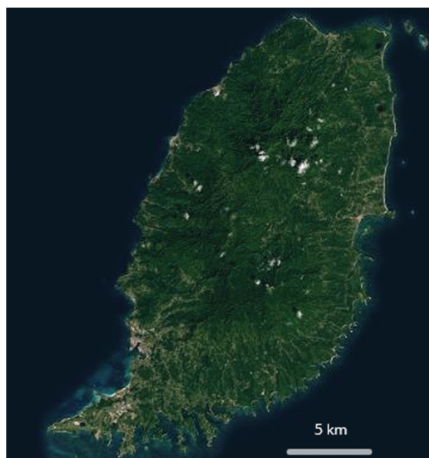
Fig. 1. Map of Grenada, West Indies. Map made with software on www.scribblemaps.com .

Twice each week from October 2016 to January 2018, mosquitoes were captured at two to five houses in St. George Parish, Grenada (Figs. 1 and 2). For each site, one Biogents Sentinel (BG-S, Regensburg, Germany) trap baited with octenol and yeast-based carbon dioxide attractants (Aldridge et al. 2016) and three to five Biogents Gravid Aedes Traps (GAT) with 500-ml alfalfa infusion (Ritchie et al. 2014) were placed within 3 m of houses to attract mosquitoes. After 24 h, traps were collected, and mosquitoes were dispatched at -80^{\circ}\text{C} . Subsequently, mosquitoes were identified to species by morphological analysis; because morphological keys that include recently introduced invasive taxa are not available for Grenada or Caribbean islands, Darsie and Ward (2005) and Lane (1953) were used to discriminate between species known to occur in Grenada according to the Walter Reed Biosystematics Unit (2019). Noticeably, engorged Ae. aegypti and Cx. quinquefasciatus females caught in BG-S traps and all Ae. aegypti caught in GAT traps were processed individually.