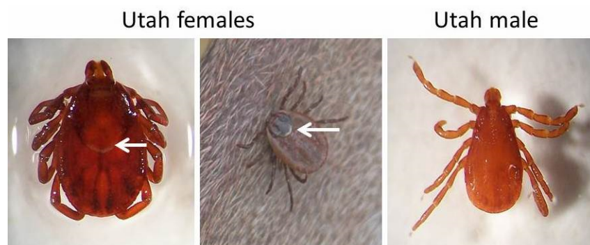
FIGURE 1. Scant gray ornamentation seen on Utah specimens of Dermacentor parumapertus .

Seventy-four adult D. parumapertus ticks (21F, 53M) were removed from 8 black-tailed jackrabbits in central Utah, while 13 adult D. parumapertus (7F, 6M) were found on 4 jackrabbits in western Texas. Three of the Utah rabbits had no ticks on them, while others were heavily parasitized. Ticks were primarily found in the ears and on the head. As for ornamentation, the Utah specimens were barely ornamented. Females displayed only slight gray ornamentation near the posterior edge of the scutum and small spots of whitish-gray distally on the femurs of legs II, III, and IV; males were completely devoid of any ornamentation (Fig. 1). The description of female D. parumapertus ornamentation in Arthur's monograph (Fig. 2) almost exactly matches the pattern we observed in the Utah samples (Arthur 1960). In contrast, Texas specimens were richly ornamented in white. Females were brightly marked with white (not gray) on the scutum very similar to D. variabilis (Fig. 3), and had white spots distally on all femurs. Males from Texas were variously ornamented along the posterolateral margins of the scutum and displayed white spots distally on all femurs.