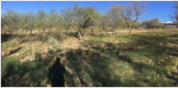
Image 9. Fishscale structure built on eroding slope, 1 year later. Grasses have returned and rocks are barely visible.

School staff to pilot an after-school program that hired Tohono O’odham students to work alongside conservation professionals, designing and installing a rainwater-harvesting native plant and heritage food garden on campus. This program, called Şu:daḡi ‘O Wuḡ Doakag , O’odham for “Water is Life,” was designed for Tohono O’odham youth to earn valuable skills, training, and work experience. During the 2018/2019 pilot program, youth worked hard to improve their campus, build habitat for native pollinators, harvest precious rainwater, and sow seeds of hope for future generations of youth. Participants were presented the Stewardship Award at the annual Tohono O’odham Earth Day festival hosted by the Tohono O’odham Environmental Protection Office. A second year of Şu:daḡi ‘O Wuḡ Doakag began in the fall of 2020, led by Tohono O’odham Community College students with mentorship and curriculum development by BRN staff. And simultaneously, BRN has been approached about developing youth restoration programming in the Mexican border city of Agua Prieta, Sonora. Along with healing landscapes, restoration can heal cultural relationships.