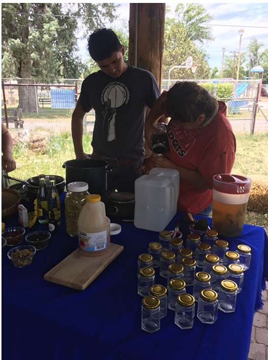
Image 4. BECY crew making immune-boosting elderberry syrup.

And BECY graduates in Douglas are now pursuing livelihoods in land conservation and restoration.