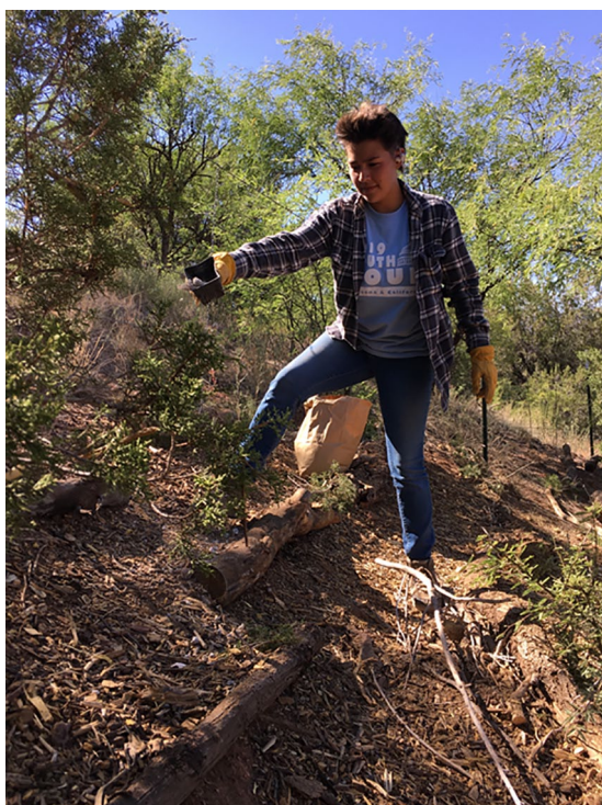
Image 6. BECY crew casts grass seeds on private ranch.