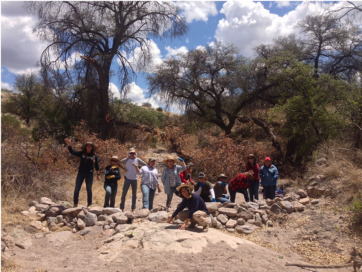
Image 1. BECY crew with rock structure.