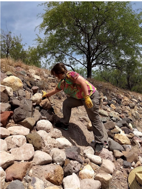
Image 2. BECY team member with rock structure.

During the summer of 2019, BECY Institute celebrated the eighth year of programming. Since it began, BECY interns have built more than 2,000 erosion control structures across three