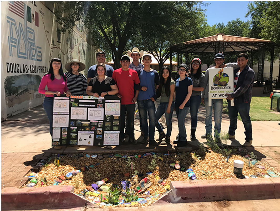
Image 3. BECY crew at infiltration basin in Douglas, Arizona.