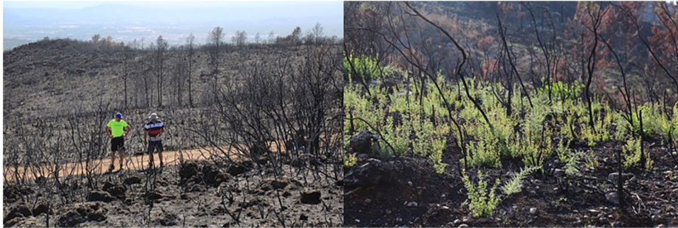
Figure 5. Wildland fires induce a sudden removal of the plant cover, but soon plant cover recovers and changes in plant composition as a consequence of the fire takes place. Carcaixent, Eastern Iberian Peninsula. To the left June 22, 2016, to the right September 8, 2016.

having larger, more intense, and severe wildland fires (San-Miguel-Ayanz, Moreno, & Camia, 2013; Figure 5).