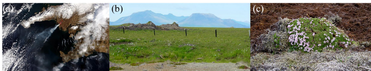
Figure 2. (a) The Myrar wildland fire on 30 March 2006 at 12:55 (image from NASA/MODIS), (b) Myrar 24 July 2006, and (c) edge of a moss fire in June 2007 (Photos: Throstur Thorsteinsson).

lowland coniferous plantations, fire damage can be significant (Szatmári et al., 2016). Human-induced fire, which is generally ignited unintentionally, is the major cause of wildland fires. Arson, for example, affects approximately 10 000 ha of grassland per year (Deak et al., 2014). Prescribed burning is scarcely applied due to legislative constraints, even though in grasslands it may present a feasible solution for several conservation challenges, for example, for increasing landscape-scale diversity, creating habitats for specialist species or for decreasing the amount of accumulated litter (Deak et al., 2014) and also for the protection of the endangered great bustard (Végvári et al., 2016).