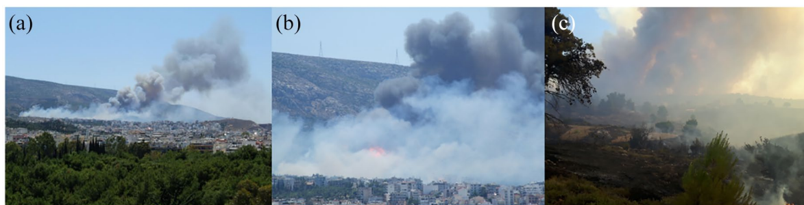
Figure 1. (a) A peri-urban fire on Mt Hymettus, in the outskirts of Athens, on July 17, 2015, with one fatality (Photo: G. Xanthopoulos), (b) a peri-urban fire on Mt Hymettus, in the outskirts of Athens, on July 17, 2015 (detail) (Photo: G. Xanthopoulos), and (c) fire in the rural area of Kalamos Attica Greece (summer 2017) (Photo: K. Stampoulidis).

area burned since 1991 was around 447 ha but only 283 ha between 2009 and 2018. Nevertheless, 2018 had the second highest forest area burned since 1991. The average area burned per fire generally around 0.5 ha. The current regional hotspot of wildland fires is in the region of Brandenburg with more than half of the area burned during the largest fires in 2018 (725 ha burnt only in August) and almost three times more than in the dry summer of 2003 when approximately 600 ha of forest has burnt in this federal state. This region is very prone to wildland fires as it has large proportion of connected forest area (44% of the forest is under protection, LFU Brandenburg), which are formed by pine monocultures on sandy soils, a particularly dry and flammable forest type. Since the industrialization, changes in forest management in several regions of former Prussia have replaced some of the previous and less-flammable forest dominated by deciduous trees (Dietze et al., 2019) by pine monocultures. This deep transformation was only possible by strong intervention into the hydrology, for example, building drainage ditches, which now are increasing drought problems, and thus fire susceptibility, in the mid mountain ranges.