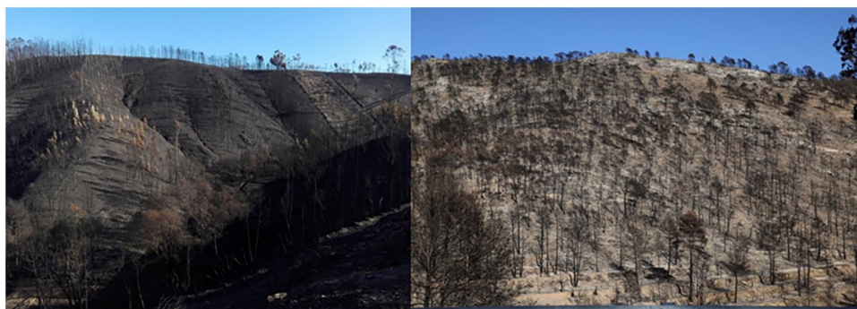
Figure 4. To the left, the recently area burned near S. Pedro de Alva village following the 15 October 2017's wildland fires in Portugal. To the right, view of the wildland fire, July 15, 2018. The Iberian Peninsula shows a long history of wildland fire, which in the last 60 years resulted in recurrent wildland fire in the north of Portugal and the Galicia region (NW) region of Spain.

conditions (Glasa et al., 2010). However, the most important changes in wildland fire prevention were adopted after the wind disaster disturbance in Southern part of the High and Low Tatras in November 2004 where about 120 km 2 of forest were destroyed. New requirements for landowners and land users were introduced for mapping the spatial distribution of water bodies, road network, and warehouses with tools for fire-fighting and building fire prevention measures. Research on the impact of fire on soil hydraulic properties (Novák et al., 2009), the effect of vegetation on hydro physical properties of soils, evaluation of fire weather indices, forest vegetation and duff moisture content indices, and wildland fire risk assessment (Šurda et al., 2015), and impact of wildland fire on the formation of bio indicative forest beetle communities (Šustek et al., 2017) was conducted as well. The applied measures include not only technical and technological modernization of fire suppression means but also substantial improvement of preparedness of firefighters and rescue workers, regional, national, and cross-border training and cooperation as well as the development of methodologies for wildland fire risk assessment, design of progressive fire protection measures, implementation of early stage warning systems based on the CCTV smoke detection (ForestWatch, later also FireWatch) and others (Majlingova et al., 2018).