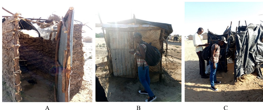
Plate 2. (A), (B), and (C) Nature of the latrines in the study area. 18