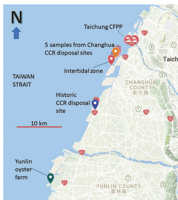
Figure 1. Locations of the 12 aquatic samples collected are pinpointed in the Google map for trace element contamination survey in Central Taiwan (Map data ©2018 Google), including 3 near the Taichung CFPP, 5 from the Changhua CCR disposal site, 2 from the historic CCR disposal site, and 2 from the background seawater (intertidal zone and Yunlin oyster farm). CCR indicates coal combustion residual; CFPP, coal-fired power plant.

Taichung CFPP is the world's second largest operating power plant with an annual coal consumption of 21 million