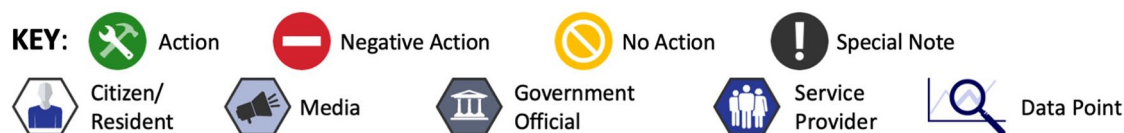
Figure 2. Legend of types of journey map inputs.

Evidence from other studies suggested that open drains have been a pervasive problem throughout informal settlements in Indore for several years. 28 Poor drainage was compounded by the build-up of trash in the drains, and roads and lanes were too narrow for trash vans to automate disposal of waste. Unsafe infrastructure built around the drains—for example, an unstable bridge over one open drain—posed a risk of waterborne diseases and injuries (especially to children) in this neighborhood.