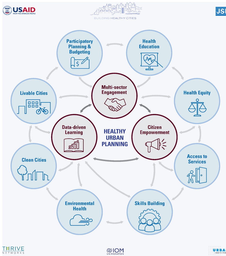
Figure 1. BHC's healthy urban planning approach.

Journey maps are a common design thinking tool used in the business and technology sectors. The journeys are meant to document how a customer interacts with a product, service, or company over a period of time, in order to better understand how to improve or optimize that interaction. 6 Citizens are like customers in that most pay taxes or direct fees to use city services, even if they are not legal citizens. To track perspectives of citizens and city officials, and to capture change at the neighborhood level over the course of this 5 year project, BHC is using journey mapping to document the experience (or “journey”) of citizens who are trying to overcome service issues. These journeys are updated on a quarterly basis.