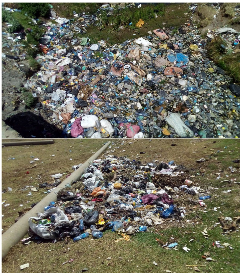
Figure 3. Waste disposed of in ditches and roadside of Fiche town.

of the respondents were aware that improper waste management leads to disease; such as diarrhea and malaria in Malaysia. 5 A possible explanation for this could be the lack of awareness on the danger posed by improper solid waste disposal in the Fiche town.