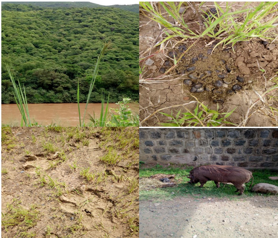
Figure 2. Forest, dung and hoof print of hippo and warthog observed downstream to Ghibe-III dam.

upstream to downstream to the less ecologically disturbed due to less human intervention. On contrary, monkeys, and apes significantly increased and moved into human settlement areas. In Kindo Didaye, which is located downstream from the dam, respondents confirmed there is a significant change in wildlife population, especially following seasonal trends due to natural phenomena and dam construction. During the rainy season when green grass occupies the area, some of the wildlife resumes their original place. Warthog, Hoof print of buffalo and hippo,