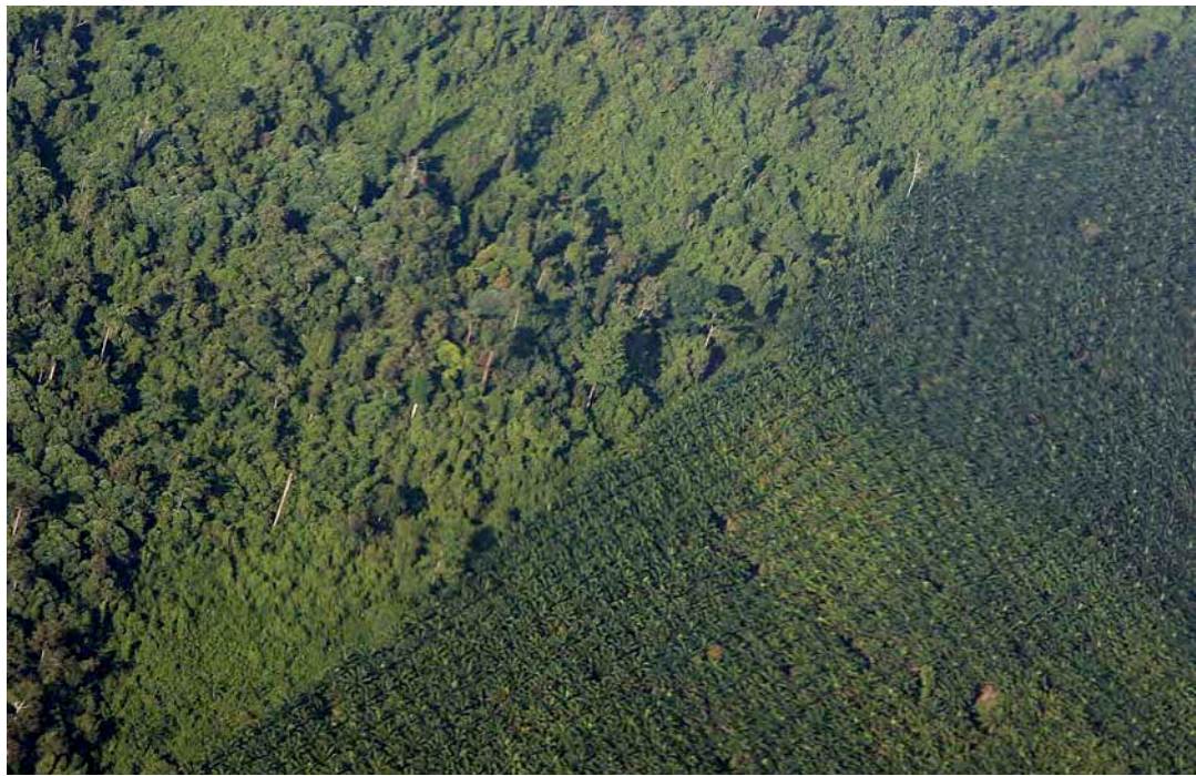
Fig. 3: Oil palm plantation adjacent to tropical forest in Sabah, Malaysia.

Key ecosystem services are also seriously diminished in oil palm plantations. On average, such plantations store less than 40% of the carbon found in native forests (assuming typical above-ground carbon values of 75 tons \text{ha}^{-1} for oil palm plantations and 200 tons \text{ha}^{-1} for native forest; [23-25]). At present, intact forests in the Amazon are a massive carbon stock, with forested lands suitable for oil palm storing around 42 billion tons of carbon [4], an amount equivalent to all global, anthropogenic carbon emissions for six years. Thus, large-scale expansion of oil palm production into forested areas could have serious, long-term impacts on carbon storage [25; 26] and other ecosystem services in the Amazon.