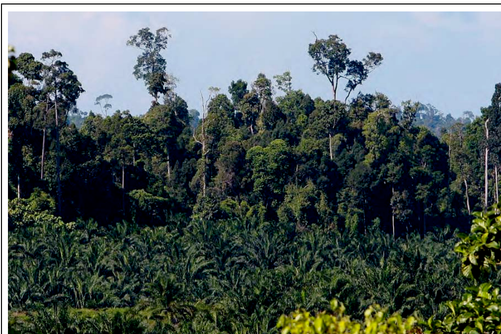
Fig. 4. Oil palm plantation adjacent to tropical forest in Sabah, Malaysia.