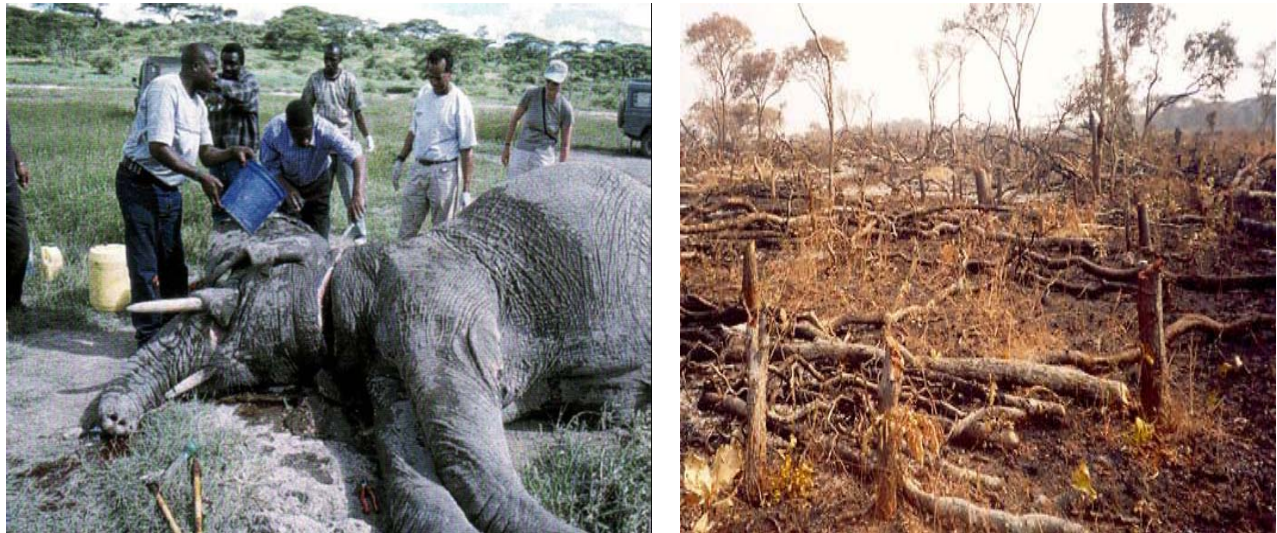
Fig 3: Human Factors in Serengeti: From Left: Effects of illegal hunting - wire snare around the neck of an elephant and Wildlife habitats destroyed for agricultural expansion,

(Kenyan part of the Serengeti ecosystem) between 1977 and 1997 and, consequently, reduction of the wildebeest population by 75%, was mainly caused by the high opportunity cost that landowners would incur by opting for wildlife conservation instead of pursuing mechanized agriculture. The latter was ecologically destructive but economically more attractive to farmers. Its profit was 15 times greater [43]. Furthermore, by virtue of being too minimal, conservation benefits do not contribute adequately to poverty reduction. People's direct dependence on natural resources has therefore remained inevitable.