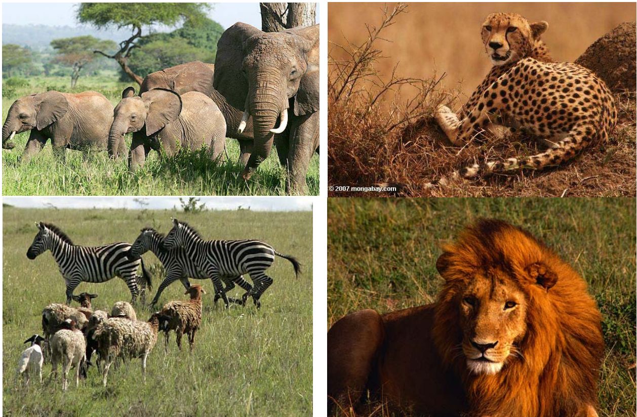
Fig.2. Four of the charismatic wildlife species found in the Serengeti ecosystem: From top left, elephant ( Loxodonta africana ), cheetah ( Acynonix jubatus ), zebra ( Equus burchelli ), and lion ( Panthera leo ). Photos of elephants, zebras and lion by V.G. Ndibalema. Photo of Cheetah by Rhett Butler.