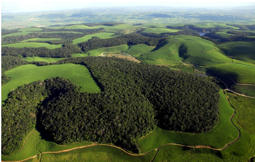
Fig. 2. A typical scenario in the Atlantic Forest at the Northeastern Biodiversity Corridor, where forest remnants are surrounded by sugarcane plantations. Most of the remaining forest fragments are, on average, smaller than 100 ha.

almost all forest remnants in this Atlantic Forest section belong to private landowners, mainly sugar and ethanol refineries. These remnants have been already mapped and classified as irreplaceable sites for biodiversity conservation [31]. Some forest remnants in refinery areas harbor more extinction-threatened birds and mammals than the reserves of the region [30]. Hence, it is absolutely necessary to find solutions to conciliate the socioeconomic development potential resulting from the expansion of sugarcane and the conservation of the biodiversity of those areas.