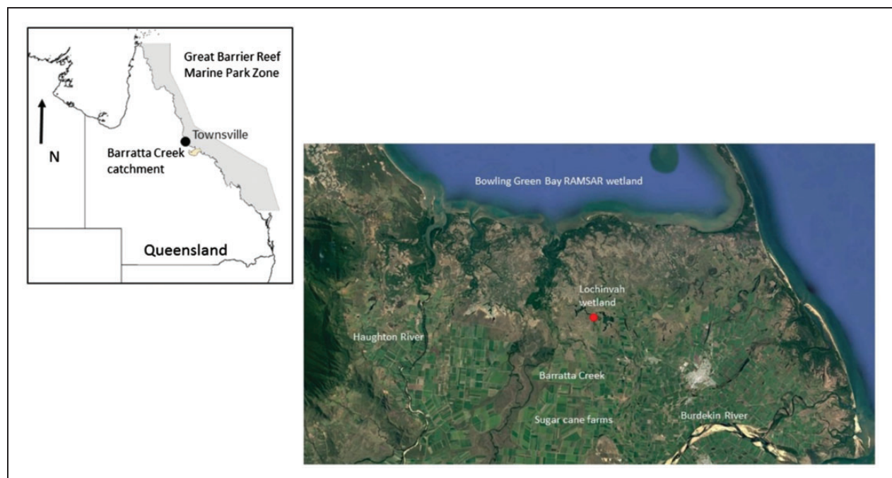
Figure 1. Location map of Barratta wetland, Burdekin River delta, north Queensland, Australia.

critical for floodplain protection (Burrows et al., 2012). In this study, we examine wetland water quality conditions before and after aerial spraying, and in doing so determine the exposure risk to fish, particularly DO conditions and water temperature. This study provides data for managers to evaluate wetland system repair projects in the GBR catchments, but these data have broader relevance given the global infestation of invasive aquatic weeds in coastal wetlands (Villamagna & Murphy, 2010).