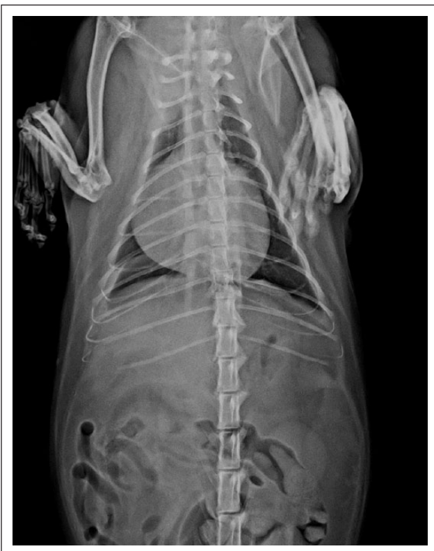
Figure 2 Ventrodorsal radiograph. There is a generalized increase in cardiac silhouette size with a globoid shape. A small volume of pleural effusion is also present. The cat is positioned obliquely