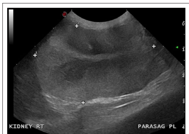
Figure 1 Ultrasonographic image of the right kidney in the parasagittal plane of a cat with histoplasmosis and renal involvement

neutrophils and a mixture of lymphocytes, plasma cells and macrophages. Serum and urine were submitted for Histoplasma antigen enzyme immunoassay (EIA) ( Histoplasma Quantitative EIA Test; MiraVista Diagnostics). No antigen was detected in the urine but antigen was detected in the serum (3.16 ng/ml; RI none detected). Itraconazole was prescribed at 10 mg/kg/day by mouth. To treat inflammation associated with dying H capsulatum organisms, prednisolone was prescribed at 0.8 mg/kg/day by mouth and tapered over 21 days. Mirtazapine was prescribed at 3.75 mg total dose by mouth every 48 h for appetite stimulation.