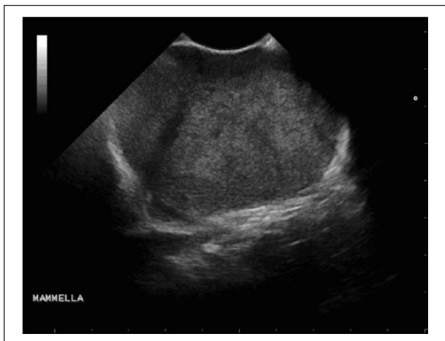
Figure 2 Ultrasonography of mammary glands with a homogeneous glandular structure and regular margins, characteristic of benign lesions