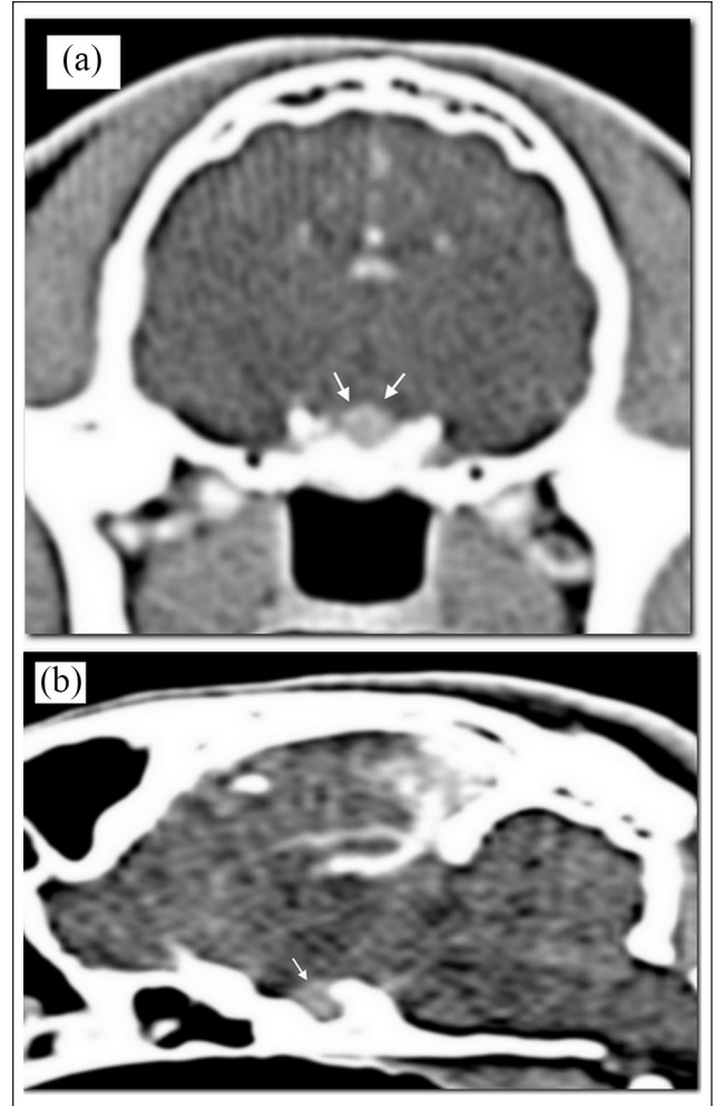
Figure 3 Post-contrast transverse CT image of the brain at the level of hypophyseal fossa. The pituitary gland is mildly enlarged (arrows, a). A mild suprasellar extension is detected in the multiplanar reconstruction on the longitudinal plane (arrow, b)

In order to better characterise the peripheral neuropathy, electrodiagnostic tests were performed. Electromyography showed mild spontaneous pathological activity of the appendicular muscles innervated by the right sciatic nerve. Motor nerve conduction studies (MNCS) and sensory nerve conduction studies (SNCS) of both sciatic tibial nerves and of the right ulnar nerve were within normal limits. Minimum F waves latencies and F ratio were severely increased in the right tibial nerve. Onset latency of cord dorsum potential obtained by stimulating the tibial nerve was increased in both pelvic limbs, and more severely in the right one. Electrodiagnostic findings were indicative of a lesion of the proximal portion of both sciatic nerves or their roots, which was more severe on the right side (Figure 4).