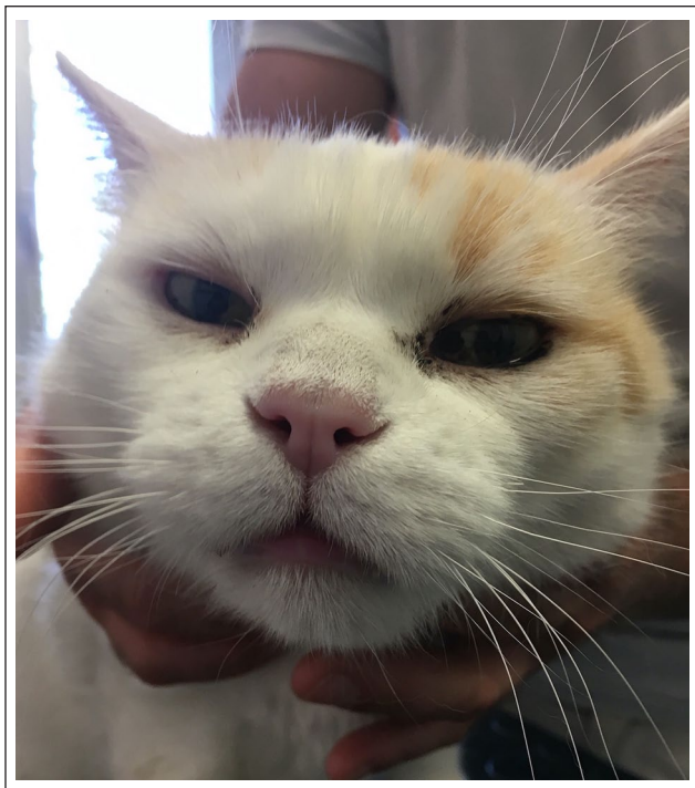
Figure 1 A 17-year-old male European Shorthair cat at time of presentation, when acromegaly was diagnosed. Note the broad facial features

glucose dysregulation ranging from 16% to 54%. 8 Despite this, for a long time, DM has been reported as the presenting problem in all acromegalic cats, sometimes being the only abnormality recognised. 3 Only recently have cases of acromegalic cats without DM been described. 9,10 These findings highlight the importance of not overlooking acromegaly as a possible differential diagnosis in cats with compatible clinical signs, even in the absence of DM. Increased knowledge of clinical presentation in these cats could improve the diagnosis of acromegaly, thus increasing the number of acromegalic cats diagnosed before DM development. The present article describes an acromegalic cat without DM with an uncommon clinical presentation.