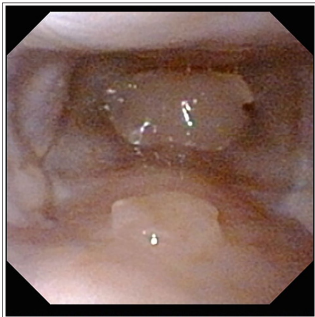
Figure 1 Before debulking, a large cryptococcal granuloma was noted arising from the floor of the nasopharynx, on the anterior-most aspect of the soft palate. Dorsal to the larger lesion was a smaller, similar appearing lesion, likely also a fungal granuloma. In these retroflexed endoscopic views, ventral is at the top of the image and the left side of the patient is the right side of the image