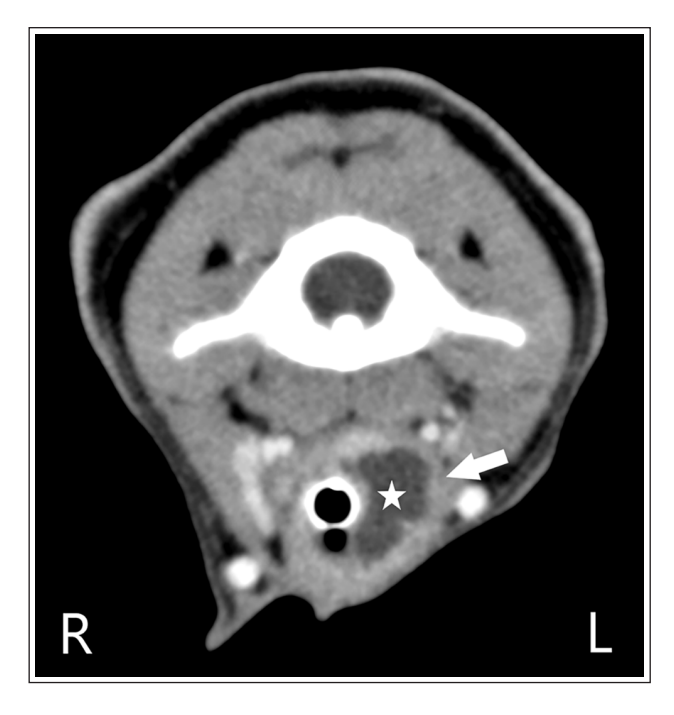
Figure 4 Post-contrast transverse CT image displayed on a soft tissue window width/window level at the level of the first cervical vertebra. A thin-walled, centrally fluid-attenuating structure (marked with a white star) is seen within the left aspect of the larynx. The structure has a thin, contrast-enhancing peripheral rim (white arrow) and occupies more than 50% of the laryngeal lumen

sterile cotton bud. The oral cavity and laryngeal region then appeared normal. The cat was given 0.2 mg/kg butorphanol (Torbugesic; Zoetis) and 0.15 mg/kg dexamethasone sodium phosphate (Dexamethasone Sodium Phosphate Injection; Vedco) IV to aid recovery and extubated without issue. The patient recovered uneventfully and was discharged the following day. The fluid was submitted for cytological examination, which revealed basophilic mucinous material (consistent with inspissated saliva), mild granulomatous inflammation with evidence of chronic hemorrhage and mild squamous epithelial atypia, which was suspected to be associated with inflammation.