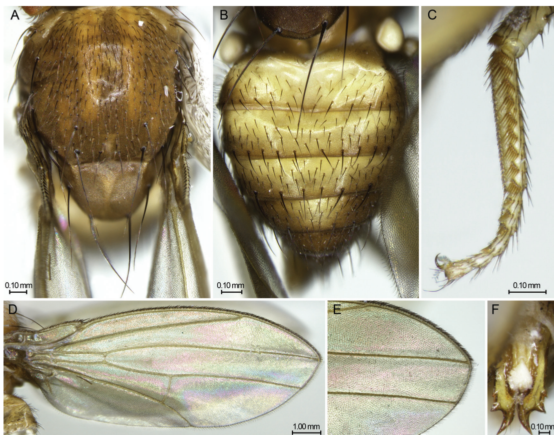
FIG. 2. Di. ancora . A–D: Male (same specimen as in fig. 1). A. Thorax, dorsal. B. Abdomen, dorsal. C. Right hind tarsus, mesal view. D. Wing. E. Female wing tip. F. Oviscapt, ventral.

2 or 3 ventral branches (exclusive of terminal fork). Vibrissa stout and long; genal setae on ventral margin of head are stout, sizes approximately equal to vibrissa, vibrissa index GS1/VL 1.10. Cheek very shallow, cheek/eye depth 0.07, gena deep, setose. Eye with dense ommatrichia, ED/EW 1.32; posteroventral margin flattened.