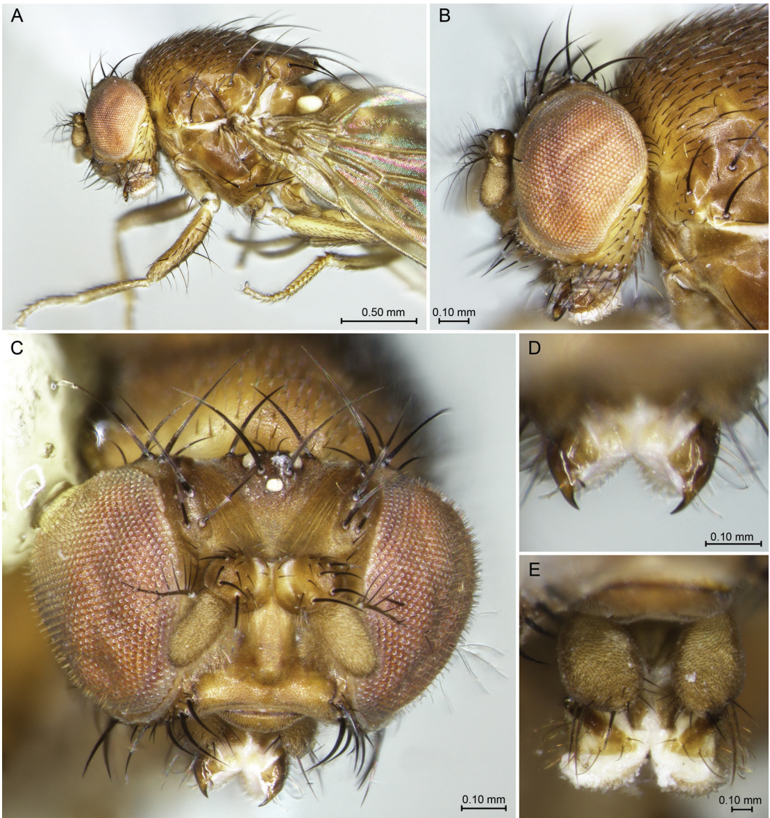
FIG. 1. Dichaetophora ancora (Okada) A–D: Male, from Vietnam (Quang Nam) A. Lateral habitus. B. Head, lateral. C. Head, frontal. D. Male mouthparts, frontal view. E. Female mouthparts, frontal view.

ate; fronto-orbital plates and frontal triangle slightly shiny. All setae robust, thick, black; anterior reclinate fronto-orbital seta relatively large, OR_2/OR_1 0.77, lateral to proclinate, posterior reclinate is longest fronto-orbital, OR_1/OR_3 0.62. Ocellar setae large, OC/POC 1.38, sockets within ocellar triangle; postocellars cruciate for \sim 0.25\times their length. Verticals and postgenal setae robust, VT index 1.12. Antenna: pedicel and flagellomere 1 aligned \sim 30^\circ outward from vertical; pedicel with five stout setae, several smaller ones, longest seta on ventromedial corner (length equal to flagellomere 1); microtrichia on flagellomere 1 short; arista with 6 or 7 dorsal,