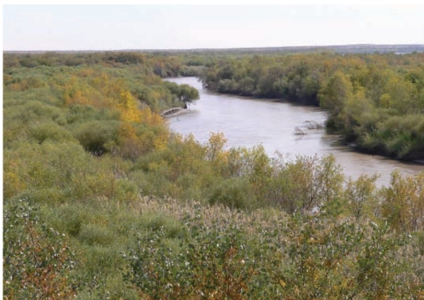
Once widespread throughout the Central Asian desert and plains, tugai, a low-growing riparian forest, still lines the edges of the region’s largest rivers—the Syr Darya, Amu Darya, Murghab, Tedzhen, Ili, Zeravshan, Vakhsh, and Naryn.