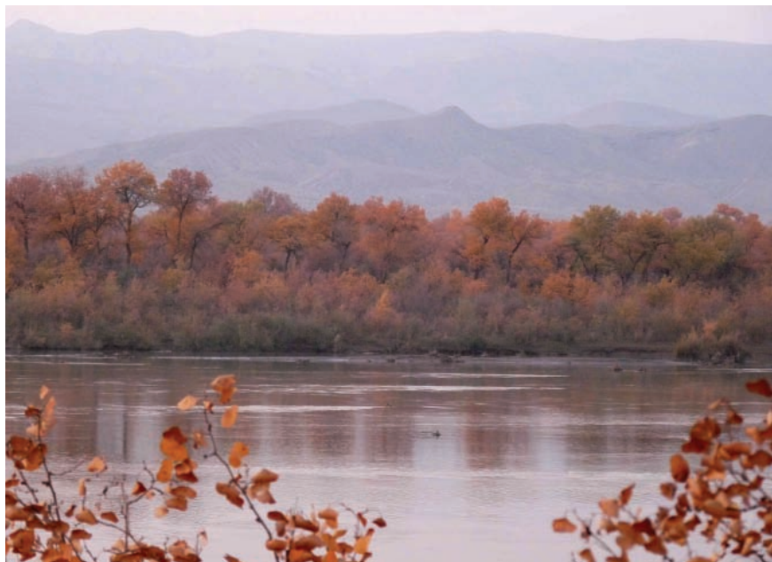
Tigrovaya Balka Nature Reserve is located in Tajikistan close to the Afghan border, where the Vakhsh River (pictured here) flows. Although the Caspian tiger for which the reserve is named is gone, Tigrovaya Balka is still home to the tiger's main prey, the Bukhara deer.

Wherever tugai thrives, it's composed of a gallery of impenetrable thickets entwined with lianas, dotted by patches of grassy clearings, and interspersed with wetlands. Poplar, willow, and tamarisk trees alternate with meadows and reeds. Briar roses and honeysuckles twist through the understory. "If you were flying over tugai," Pereladova says, "you'd see willow and poplar forests almost indistinguishable from meadows and swamps."