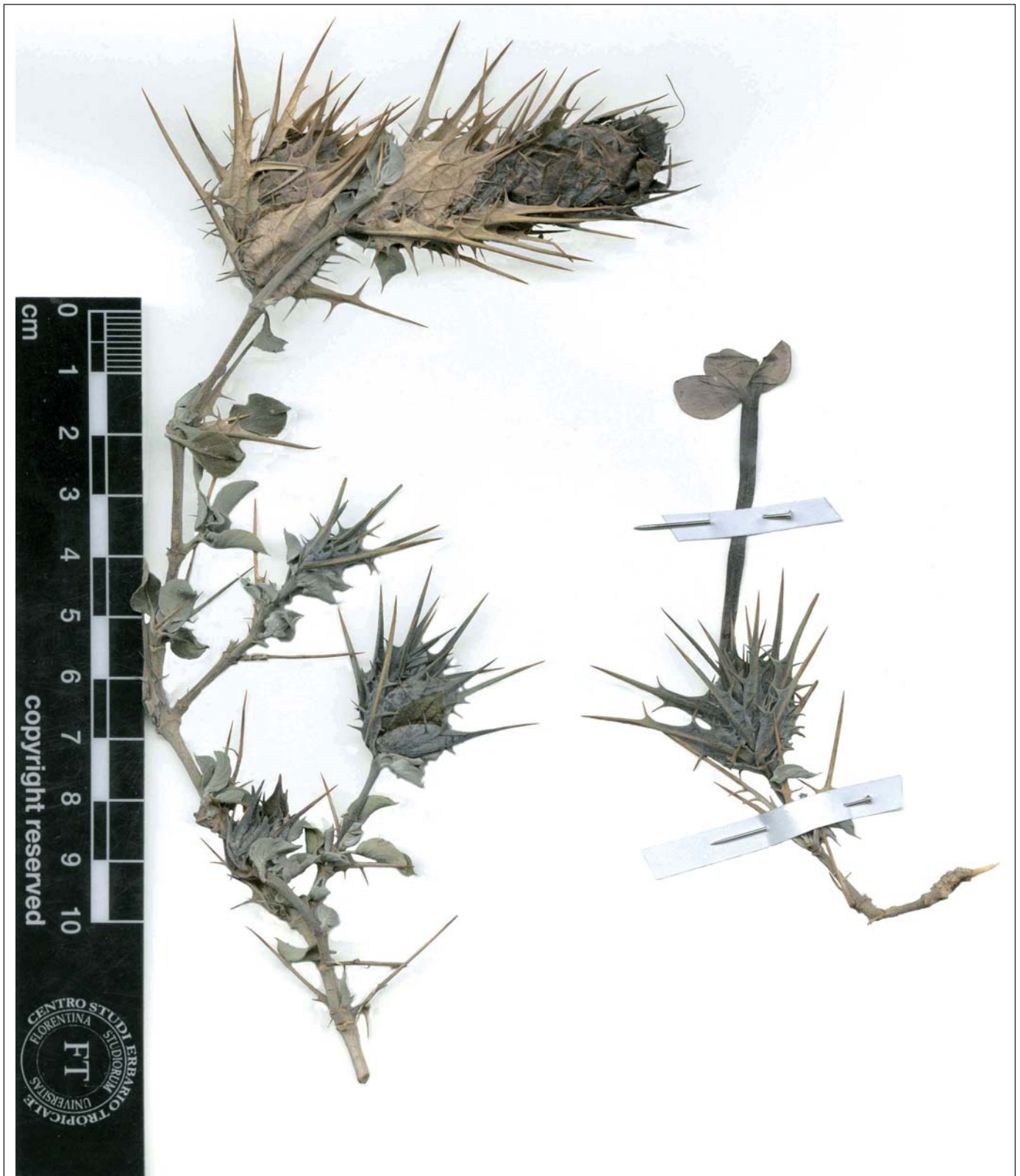
Fig. 2. – Details of Barleria almughsaylensis Mosti, Raffaelli & Tardelli.