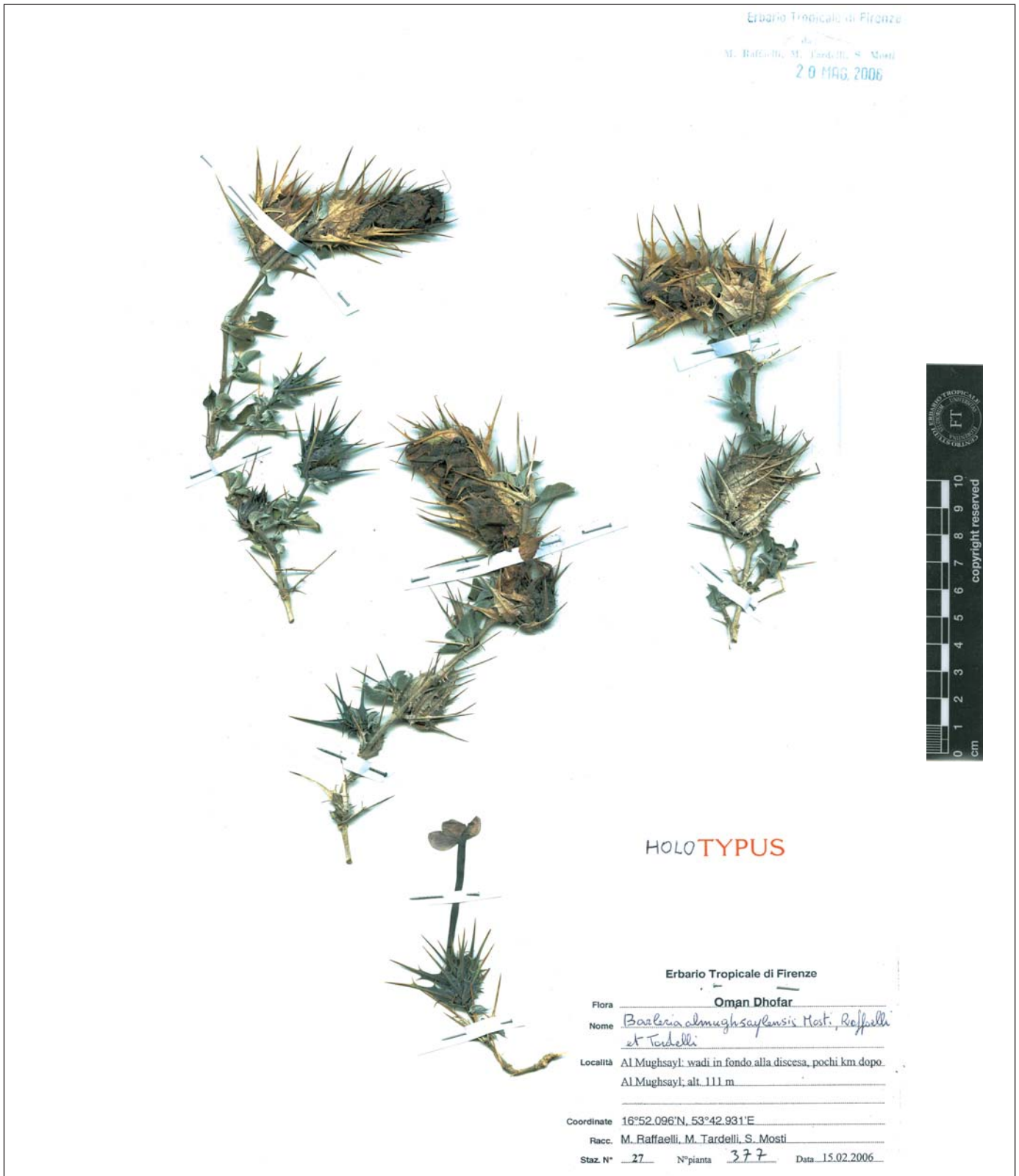
Fig. 1. – Holotypus of Barleria almughsaylensis Mosti, Raffaelli & Tardelli. [Raffaelli, Tardelli & Mosti 377, FT]