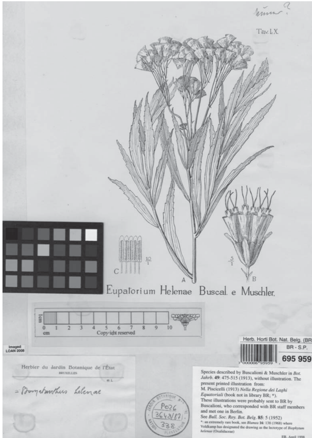
Fig. 1. – Illustration of Eupatorium helenae Buscal. & Muschl. found in BR.